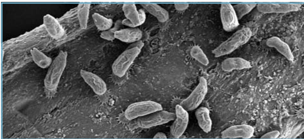
GS infestation on dorsal fin

The main host of GS is the Atlantic salmon, although other salmonids are also susceptible including; rainbow trout, Arctic char, North American brook trout, grayling, North American lake trout and brown trout.