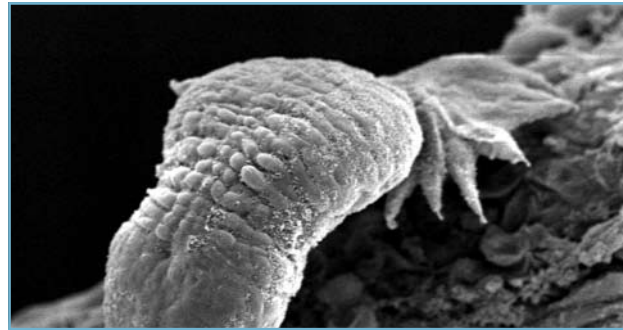
The parasite viewed under an electron microscope

GS is a small worm like organism up to 2mm in length. It attaches to the fins, gills and skin of fish using specially modified hooks. Once attached the parasite feeds by releasing digestive enzymes on to the skin of the fish and then consumes the digested material.